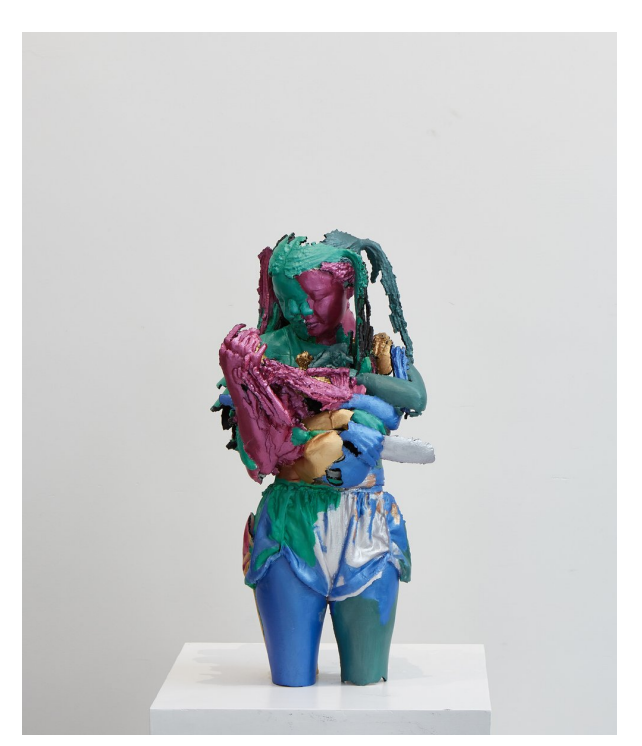
Liu Bolin. Chaos No.6 - Little Girl, 2024. Painted hyper polylactic acid, 22 x 9 7/8 x 11 7/8 inches (56 x 25 x 30 cm) Unique Courtesy of the artist and Eli Klein Gallery © Liu Bolin