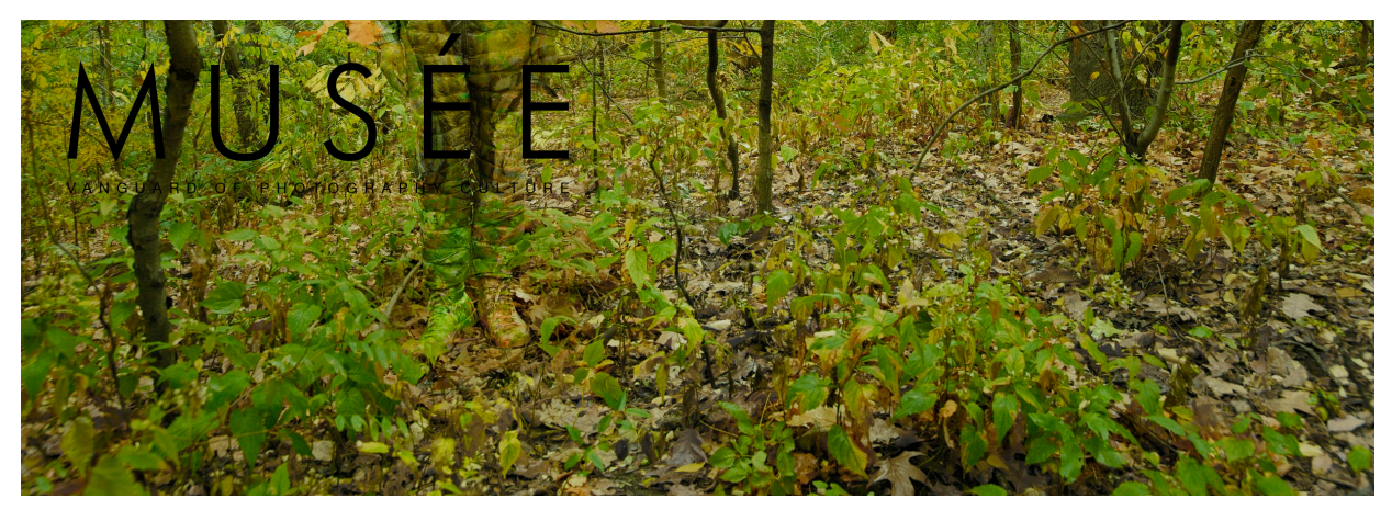
Liu Bolin (born Shandong, China, 1973). Central Park, 2016 Archival inkjet print 53 1/8 x 70 7/8 inches (135 x 180 cm). Photograph by Annie Leibovitz. Courtesy of the artist and Eli Klein Gallery © Liu Bolin © Annie Leibovitz