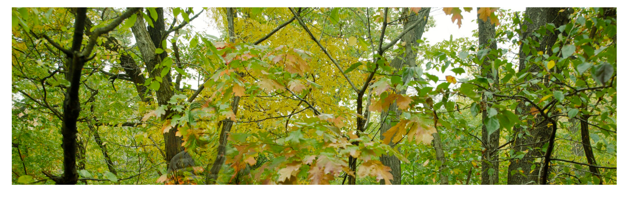
We use cookies and similar technologies to run this website and help us understand how you use it. Musée never shares your data.

The collection is a thought-provoking exploration of visibility, identity, and the digital footprint. The sculptures, fragmented yet whole, visible yet invisible, invite introspection about our place in a digital landscape that both defines and obscures. The outdated 3D scanner, rather than a limitation, becomes a metaphor for the imperfections and disruptions of digital translation, sparking a reflection on the authenticity of our online selves. Through these works, Bolin and his collaborators invite viewers to peer beyond the surface, challenging them to consider the layers of meaning hidden in plain sight.