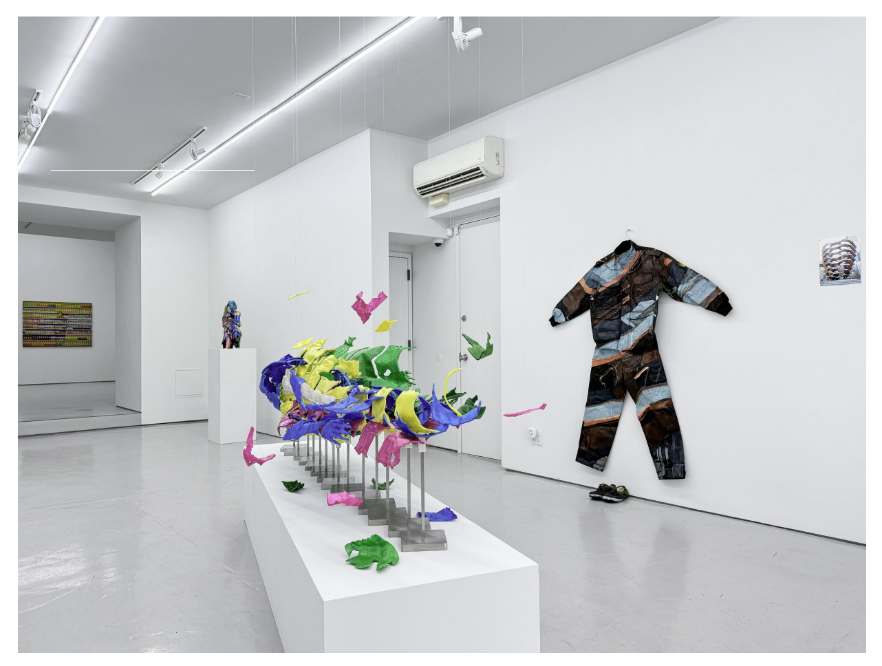
Liu Bolin (born Shandong, China, 1973). Chaos - Me, 2024. Painted UV curable resin and stainless steel 26 x 82 5/8 x 29 1/2 inches (66 x 210 x 75cm) Unique.

"Like the uniform I wear, akin to a chameleon, imbued with vitality, I will observe and interpret the world in my way. As long as I exist, my art creation journey will endure."