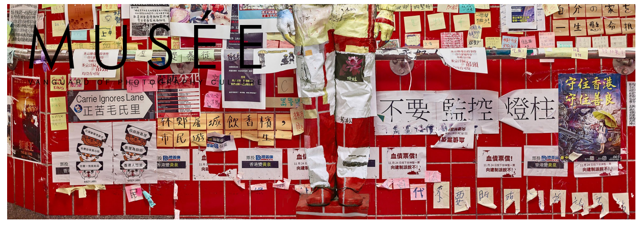
Liu Bolin (born Shandong, China,1973). HK Message Wall, 2019. Archival inkjet print, 44 1/4 x 59 inches (112.5 x 150 cm).

"In my works, through the disappearance of my personal body or the disappearance of the people around me, I have been trying to ask questions about the relationship of mutual constraint and dissolution between human beings and the civilization created by mankind."