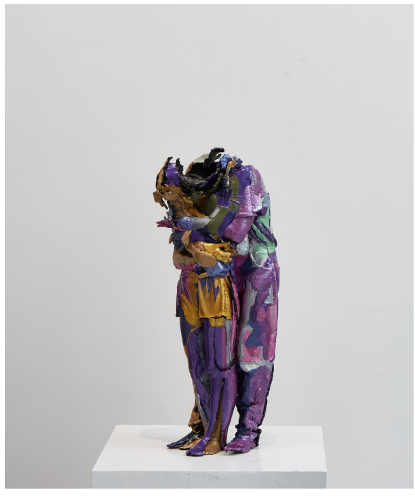
Liu Bolin. Chaos No.7 - Couple, 2024. Painted UV curable resin, 22 x 8 5/8 x 8 5/8 inches (56 x 22 x 22 cm) Unique.